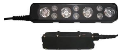
Extrem' Vision LBI1 RAID Lighting