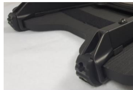
Rugged corner protectors