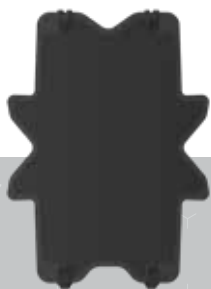
Tactical - Large 915 x 690mm 10.0kg

NP Aerospace tactical shields offer lightweight multi-hit bullet and blast protection for high-risk tactical teams to NIJ Level III + special threats. A range of designs are available with viewports, weapon rests, and adjustable lightweight ballistic handles for optimum manoeuvrability. RAID Lighting and camera systems can be fitted. Shields meet the protection requirements of NIJ 0108.01 Level III+ Special Threats including 5.56x45mm M193 & 7.62x39mm M43/M67. They offer lightweight protection at 3.28 psf (16kg/m²) and blast fragmentation at 17gr FSP V50 >1400m/s.