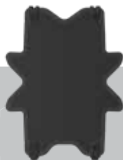
Tactical - Small 715 x 590mm 7.2kg