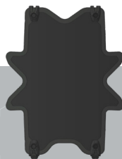
Tactical - Small 715 x 590mm 7.2kg