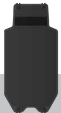
Large 1205 x 605mm 14.5kg