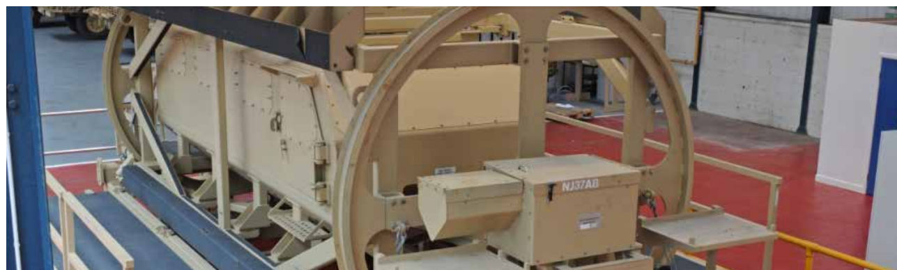
Engineering Authority for Roll Over training simulator used to train military staff prior to deployment.