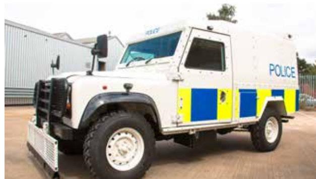
Designed, integrated and armoured composite Snatch Land Rovers for military and law enforcement operations.