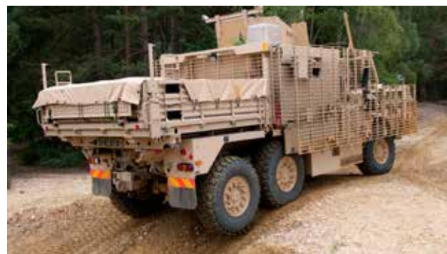
Engineering Technical Support Provider for the entire UK Protected Mobility Vehicle Fleet.