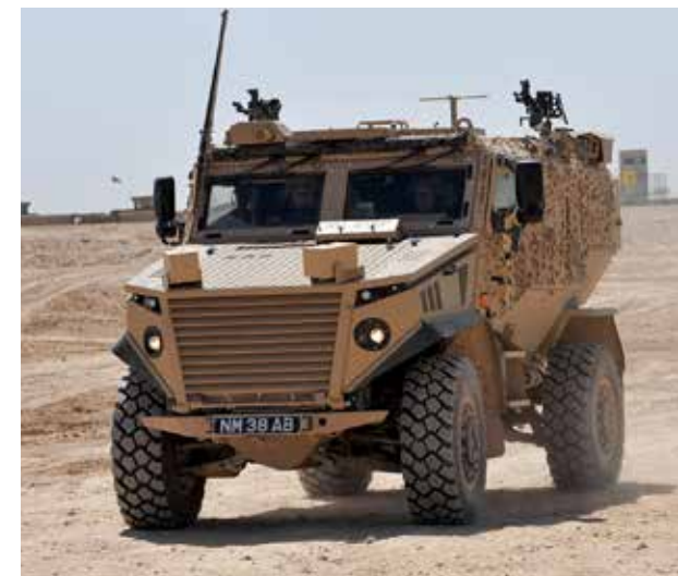
New hybrid electric drive Foxhound and Jackal vehicles for the British Army to improve stealth capability and environmental impact, working in conjunction with General Dynamics, Magtec and Supacat.

Our vehicle integration pedigree is built on our extensive integration history, world class facilities and expert know-how, which set us apart from other providers: