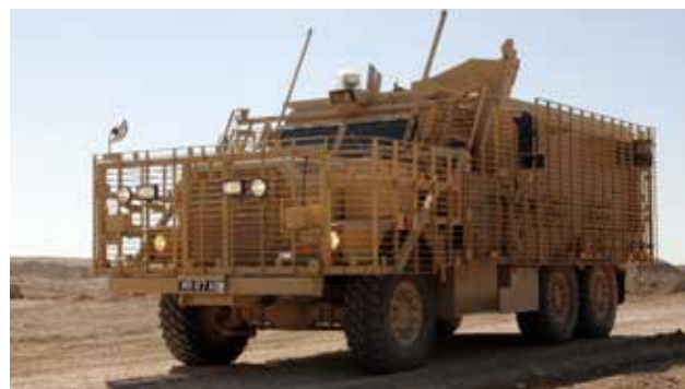
Integrated over 700 Cougar family vehicles and 30 platform variants, including the Mastiff, Ridgback, Wolfhound and Buffalo.