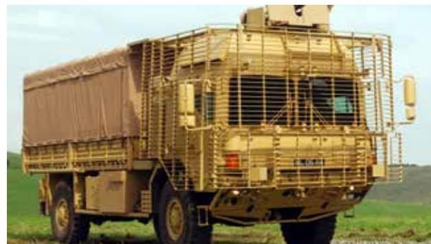
Designed, integrated and armoured over 380 MAN military trucks.