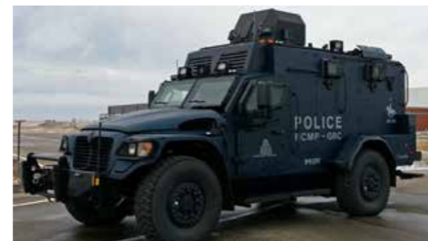
Lightweight collapsible protected weapons stations for Navistar.