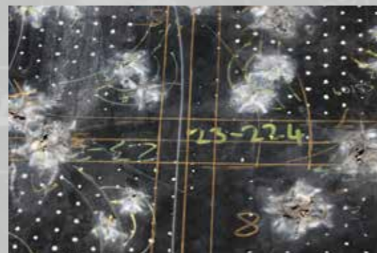
Testing at STANAG 4569 Level 4