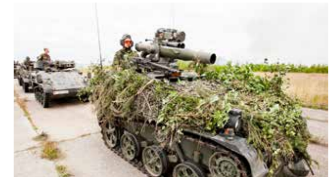
Shaped spall liner and appliqué armour for the FFG Wiesel 1 platform upgrade.