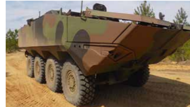
The full armour package for SAIC's ACV 1.1, including applique armour, spall liners and lightweight composite floatation boxes.