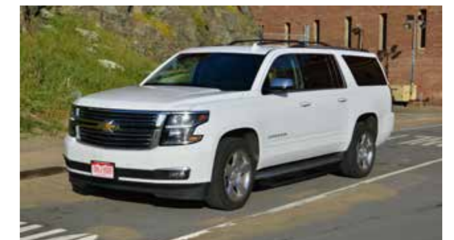
Covert vehicle armour for a variety of base platforms.