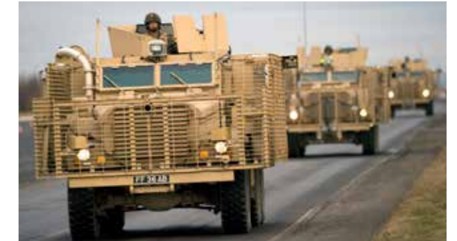
Spall liner and full armour integration for the Mastiff family of vehicles, including Mastiff, Ridgback, Wolfhound and Buffalo.