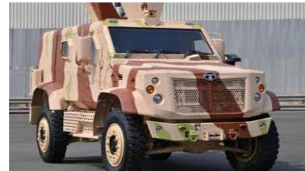
An integrated survivability capsule for TATA Motors, saving over 1 tonne of weight against steel alternatives.